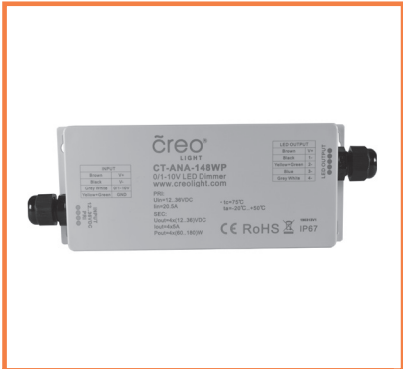
1-10V LED Dimmer 1 channel input 4 channels output IP67