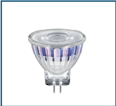
MR11 4.5W 12V AC/DC WFL GW G5 IP20