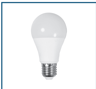
A60 9W 230V E27