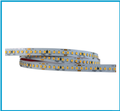
Flexible Strip G3 28W 24V IP20