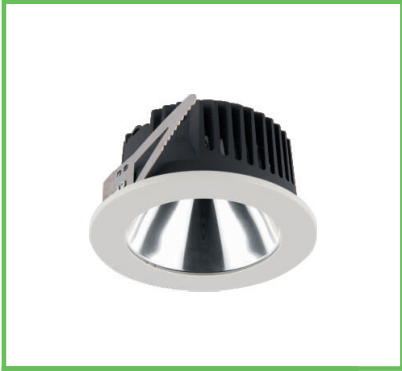
Zhaga Round Downlight DLZR05 17.3W IP44